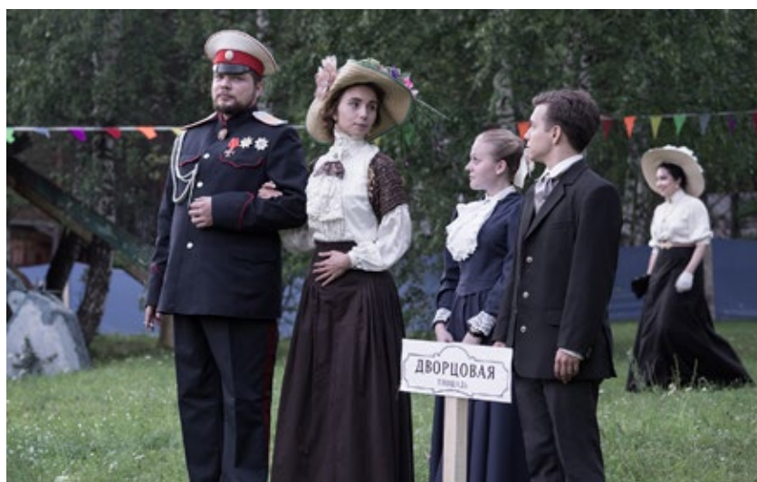
A family from the historical house of Yusupov.